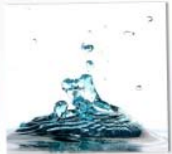
AND THE LIFE." JN 14:6