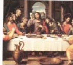
THE TRUTH ...