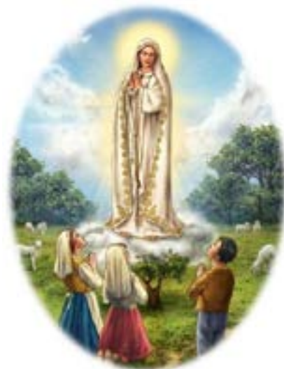
St. Rose of Lima Church