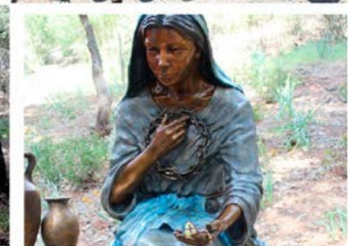
St. Rose of Lima Church